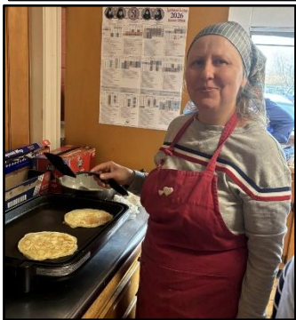
(Above and left) From the Blini festival. (Right) Preparing kulichi for Pascha